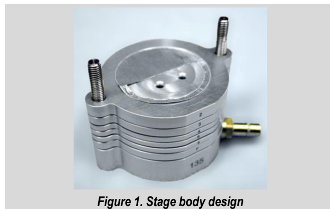
Figure 1. Stage body design

The Models 135-6 and 135-8 can be used with personal sampling pumps since they have a low pressure drop. The Model 135-10 requires a vacuum pump due to the larger pressure drop associated with the last two stages.