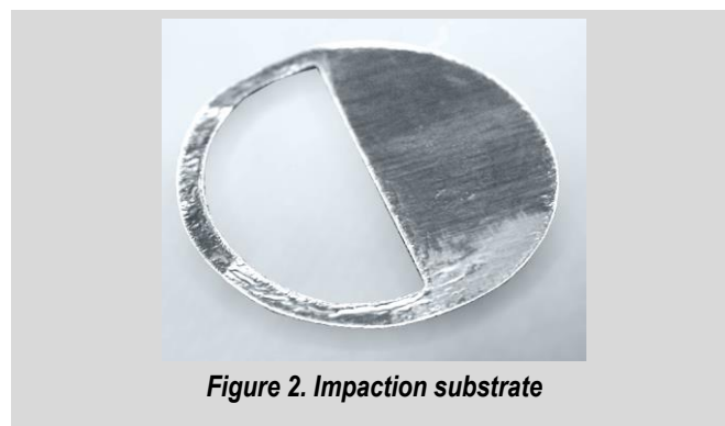
Figure 2. Impaction substrate