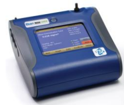
DUSTTRAK™ II or DRX Desktop Aerosol Monitor

Sub-isokinetic sampling takes place when ambient wind speed is greater than the sampling velocity found at the inlet point of the aerosol sampler. This creates a high-pressure area in front of the inlet and causes the flow streamlines to diverge around it. Extremely small particles (less than 1.0 micron) have low momentum and follow the streamlines. Larger particles that have more momentum will have a tendency to remain traveling in the same direction and enter the sampler rather than follow the streamline around it. This can cause the larger particles to be artificially sampled, resulting in a mass concentration reading that is higher than the true value.