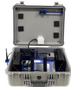
Environmental Enclosure Model 8535 with inlet assembly stored