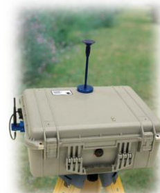
Environmental Enclosure in-use