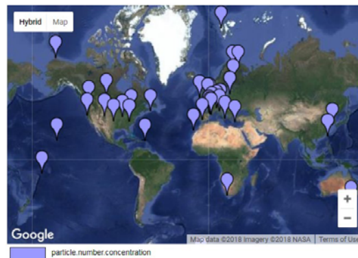
Figure 3: Map of datasets for particle number concentration measurements obtainable via the ACTRIS network.

Going beyond national-level efforts, ACTRIS is an EU-level data center providing access to concentration measurements of dozens of atmospheric constituents, including particle number concentrations and size distributions. Number concentration datasets originating from five continents can be accessed through ACTRIS at http://actris.nilo.no . A map of available datasets for particle number concentrations is shown in Figure 3.