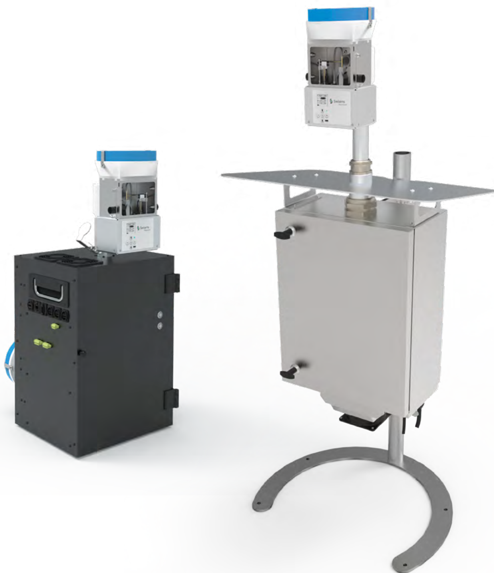
Left: SwisensAtomizer for indoor use with SwisensPoleno Jupiter