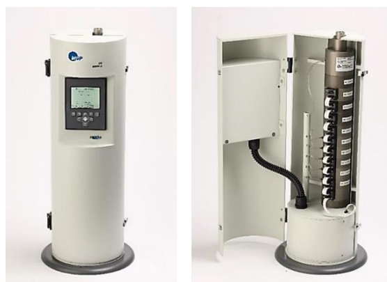
Figure 3: 120R NanoMOUDI™ impactor: exterior (left) and interior (right)

The impaction stages of the NanoMOUDI impactors rotate during sampling. This rotation results in the sampled particles being deposited over a wider area on the substrate, relative to non-rotating impactors.