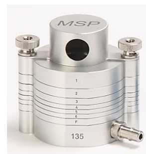
Figure 2: 135-6B MiniMOUDI™ Impactor, with optional cowl inlet installed

The MiniMOUDI™ impactors are ideal for personal sampling. They have a design flow rate of 2 L/min, which is supplied by a pump that can be worn by the user. The three models of MiniMOUDI™ have three different smallest cutpoints; users can go down to 0.56 µm, 0.18 µm, or 0.056 µm. Figure 2 shows the six-stage 135-6 MiniMOUDI impactor with the cowl inlet. This inlet is ideal for personal sampling; see the footnotes of Table 2 for more information on the available inlets for MiniMOUDI impactors.