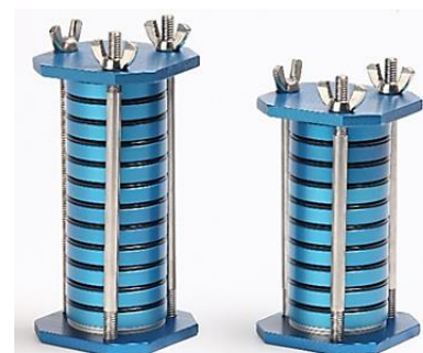
Figure 6: Spare Sets of Impaction Plates

This silicone spray is applied to substrates to minimize particle bounce. One can of the spray is included with all impactor purchases. Additional spray may be purchased using PN 0100-96-0559.