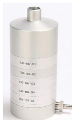
Figure 4: 130 High-Flow Cascade Impactor.

Refer to Table 2 and/or Figure 5 when selecting an impactor model. Please feel free to contact TSI® for support in selecting the impactor that is right for your needs.